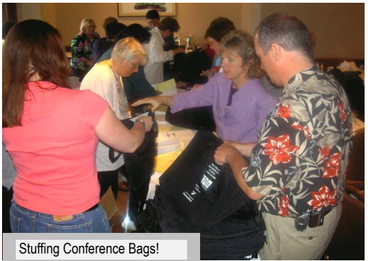
Stuffing Conference Bags!

These delegates will help shape the future of National Emergency Nurses Association.